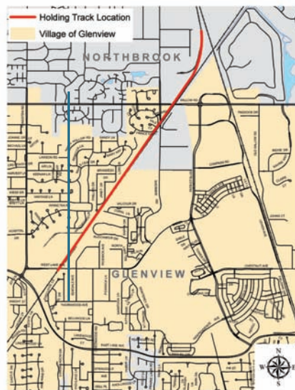
The red line indicates where the proposed holding track would be constructed along the Union Pacific tracks, from West Lake Avenue to north of Willow Road.

To accommodate the additional Amtrak trains on the Metra tracks and alleviate existing service delays, the plan calls for holding freight trains on a new 2-mile track to be built adjacent to the Union Pacific tracks from about West Lake Avenue to past Willow Road in west Glenview. The new holding track would allow a freight train to be parked and idling until it is assured clear track through the Union Pacific tracks. The new single track would be supported by a 10-foot to 20-foot tall retaining wall, require modifications