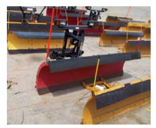
Lined up in the Public Works yard, the Village snow plows are ready for winter. Are you?

After a heavy snow, the Village will clear all major arterial sidewalks, including those along Harlem Avenue, Wauke-